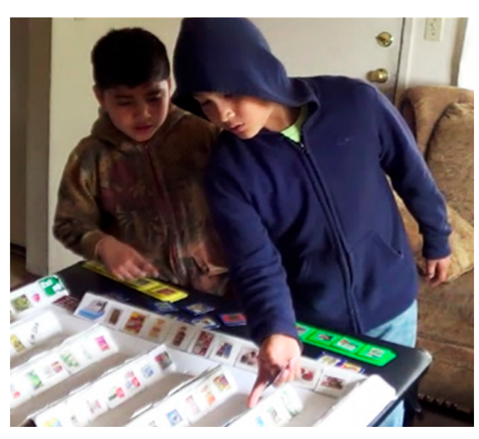
Fig. 1. Siblings planning the shopper's route for groceries that were presented on small square cards that can be seen near the children. This pair's developing route plan can be seen in the grocery cards placed in sequence of the shopping trip on the long cardholders on the table.

Fluid collaboration as an ensemble. Siblings work together with flexible coordination building on each other's ideas with shared decision making and